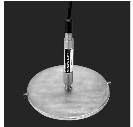
Jackout Total Pressure Cell