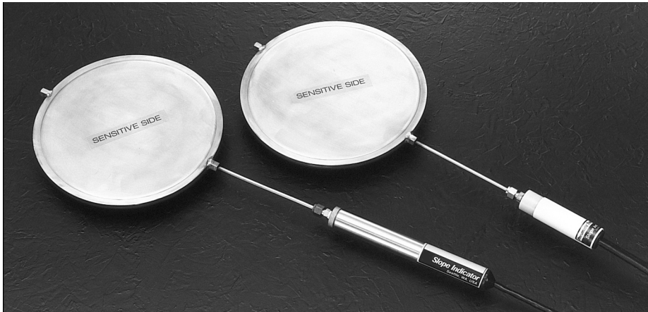
Vibrating Wire and Pneumatic Total Pressure Cells