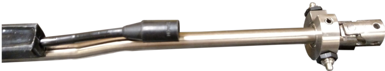
Figure 4: GeoFlex bottom node (female connector and universal joint)