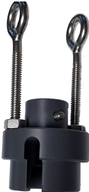
Figure 2: GeoFlex suspension kit for PVC pipe

Suspension Kit: One suspension kit is used for each string.