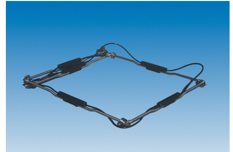
A single GeoFlex segment folded for shipment

The GeoFlex system is connected to a data acquisition system, and readings are transmitted to processing software that can trigger alarms