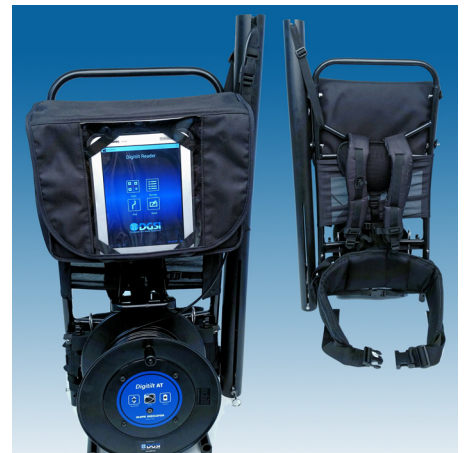
Easily take the AT system anywhere with our custom backpack

Extension Cables: Extension cables can be utilized to extend the length of a Digitilt AT System. Please note that extension cables are only compatible with detachable probes.