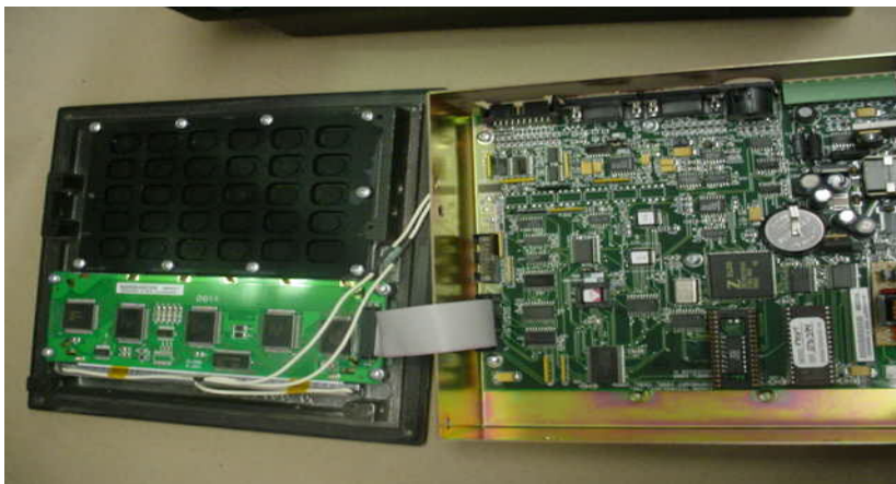
4 - Separate cover, exposing circuit board.