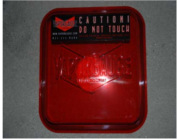
Test #2 Den