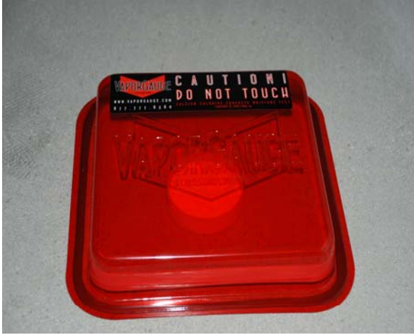
Test # 1 Kitchen