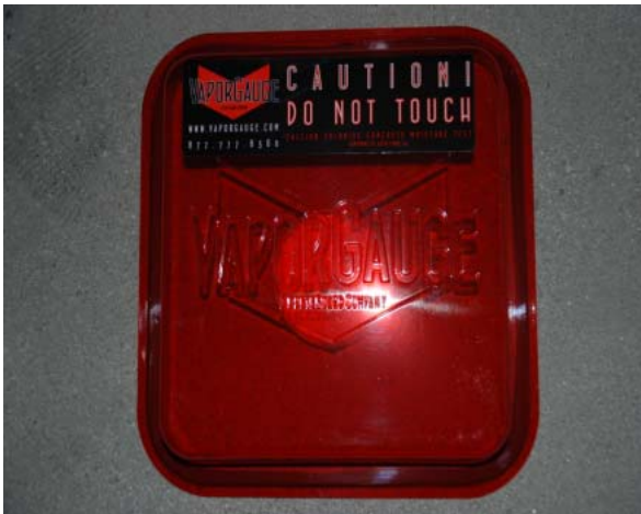
Test #3 Bath Btwn BR 3 and 4