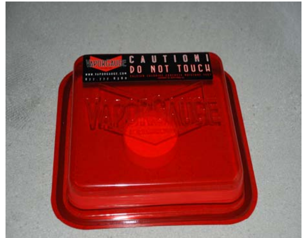
Test #4 MasterBedrom