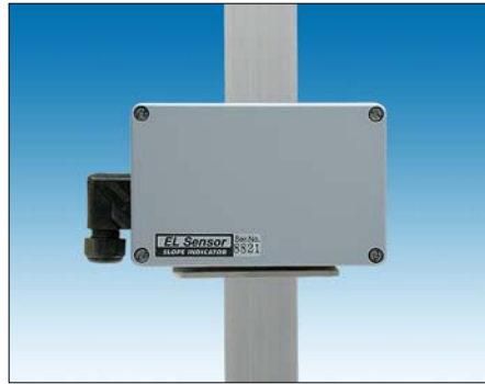
Vertical Beam Sensor