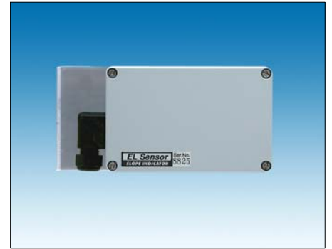
Tiltmeter with Rotating L-Bracket