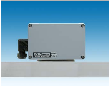
Horizontal Beam Sensor